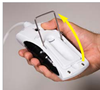
Figure 2 Extend the wire stand before opening battery door.