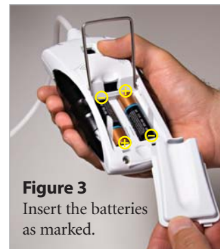
Figure 3 Insert the batteries as marked.