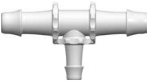
Reference part shown: T070/055

T6110 (-6005) Tee Connector with 600 Series Barbs, 1" (25.4 mm) ID Tubing