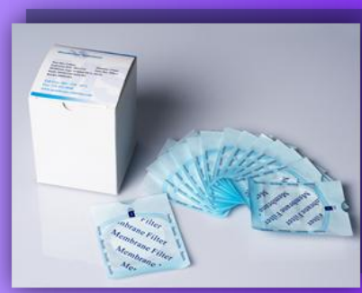
MCE Gridded Membrane