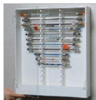
LC 30-Column Storage Cabinet