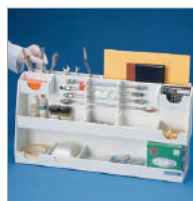
LCLocker LC Organizer

*QuickSplit post-column flow splitter serial number required for replacement resistor set to ensure compatibility. Every resistor is manufactured per serial number. The serial number is located on top of the splitter.