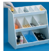
Open Supply Bins, 13-bin unit