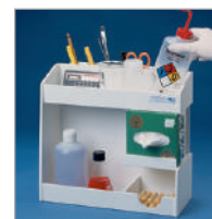
Mini pHPerch Storage Unit