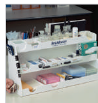
Deluxe BenchBooster Organizer