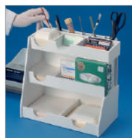
TopLoader Balance-Bank Storage Unit