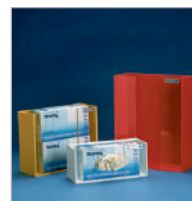
Glove Box Dispensers