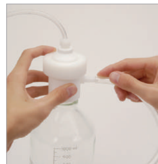
Connect vacuum line to side port.