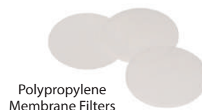
Polypropylene Membrane Filters