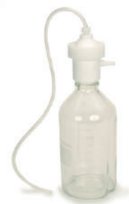
Bottle not included.

Includes universal threads designed for 4 L or Wheaton bottles. Use with GL-45 bottles requires Opti-Cap® adaptor (sold separately).