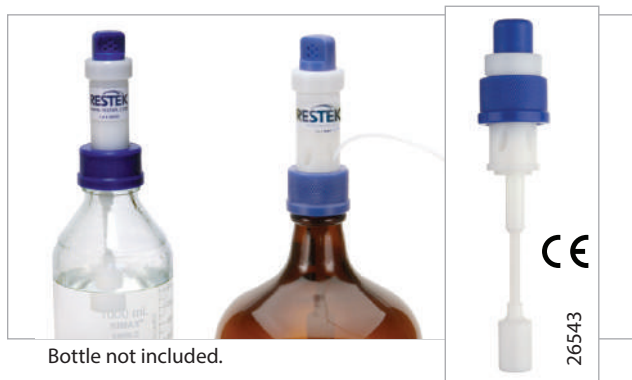
Bottle not included.