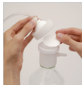
Place membrane filter on top of grid.