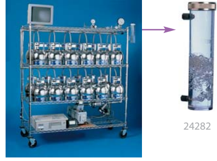
Restek's canister cleaning system with humidification chamber.

After assembly, every Restek SilcoCan® and TO-Can® canister is evacuated to 50 mTorr, then pressurized with humidified nitrogen to 30 psi. The cleaning system is programmed to repeat this cycle two times to ensure thorough cleaning. We ship our canisters clean and under pressure at 30 psi with dry nitrogen.