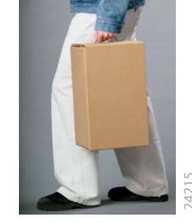
Restek canisters are shipped in boxes with handles for easy transportation.