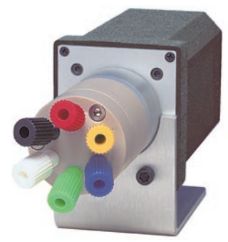
Model C22 1/4-28 fittings

CHROMalytic TECHnology Pty Ltd AUSTRALIAN Distributors e-mail: sales@chromtech.net.au Tel: 03 9762 2034