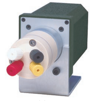
Model C24 1/4-28 fittings