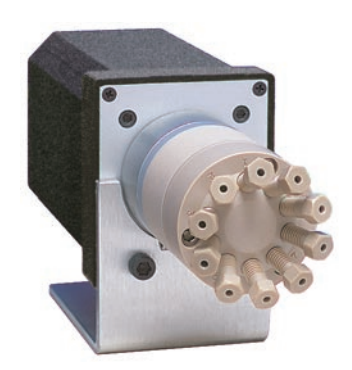
Model C22Z 1/16" ZDV fittings

Consult our technical staff for details.